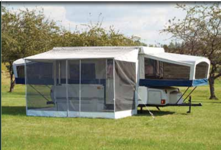
Add a screen room to your canopy for even more living space.

Not all accessories shown are available on all models.