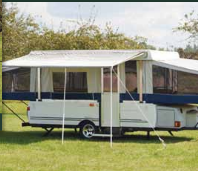
Self-storing canopy for extra shade and roominess.

Please see your dealer or go to WWW.COLEMANTRAILERS.COM for a complete list of accessories.